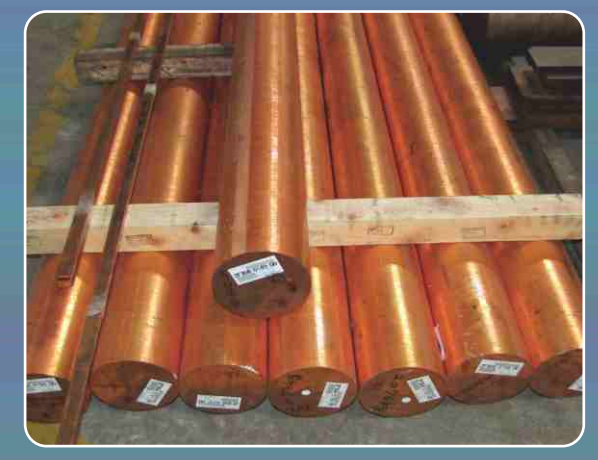
Ø200 MIPALLOY 3ZR (Cr Zr Cu) BILLETS