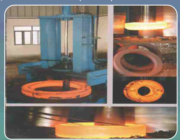
RING ROLLING OF SHORT CIRCUIT RINGS