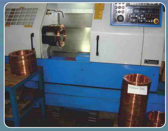
MACHINING OF SHORT CIRCUIT RINGS