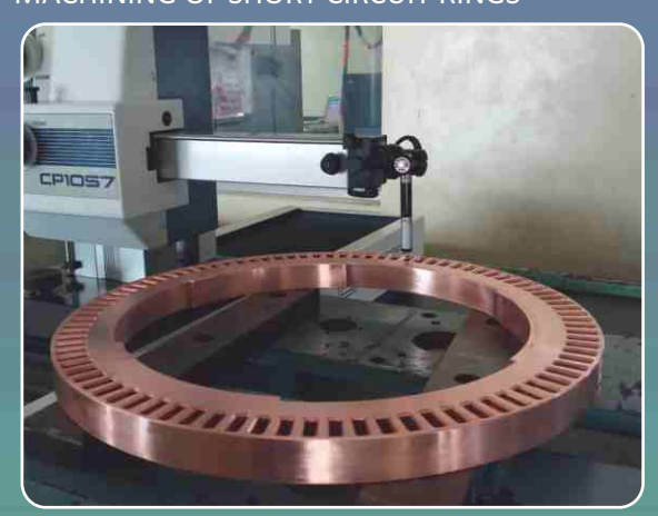
INSPECTION IN CMM