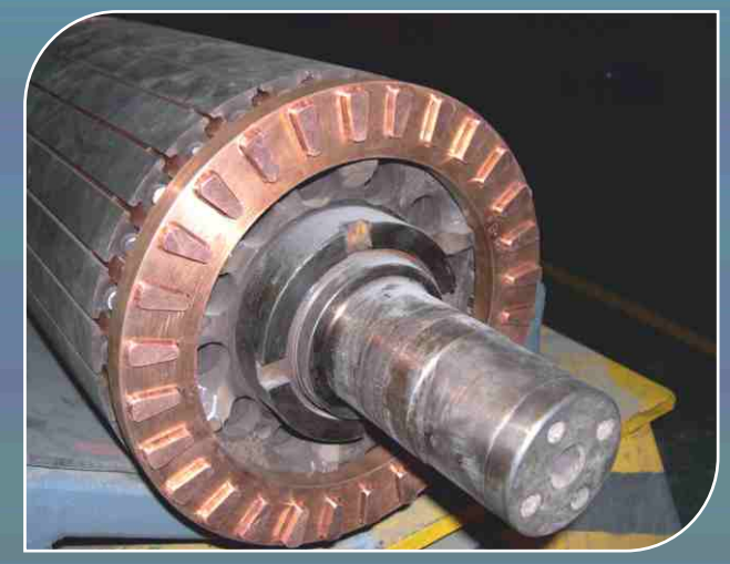
ROTOR WITH MIPALLOY 3ZR (Cr Zr Cu) SHORT CIRCUIT RINGS